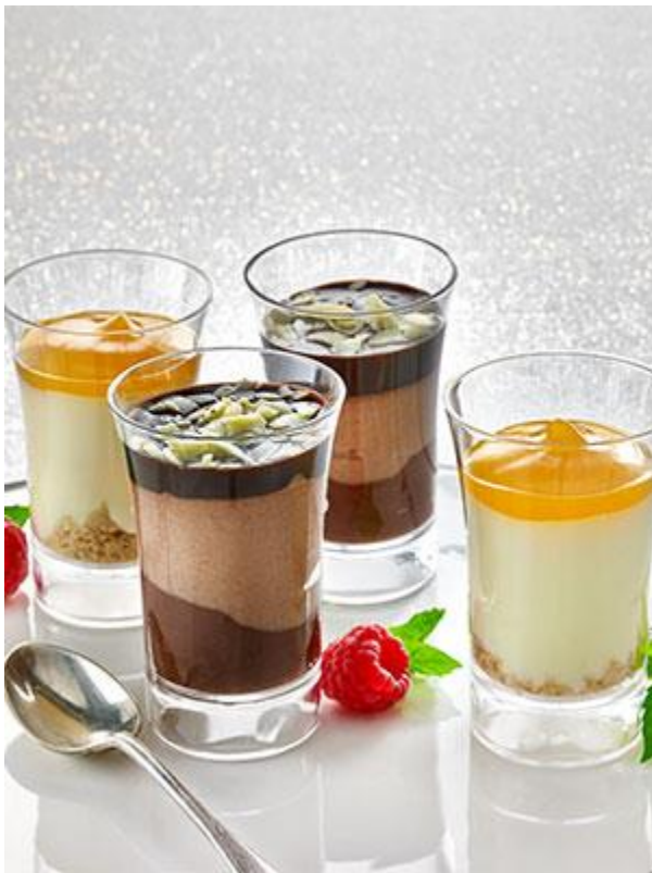
• Shotglass Desserts £15.00