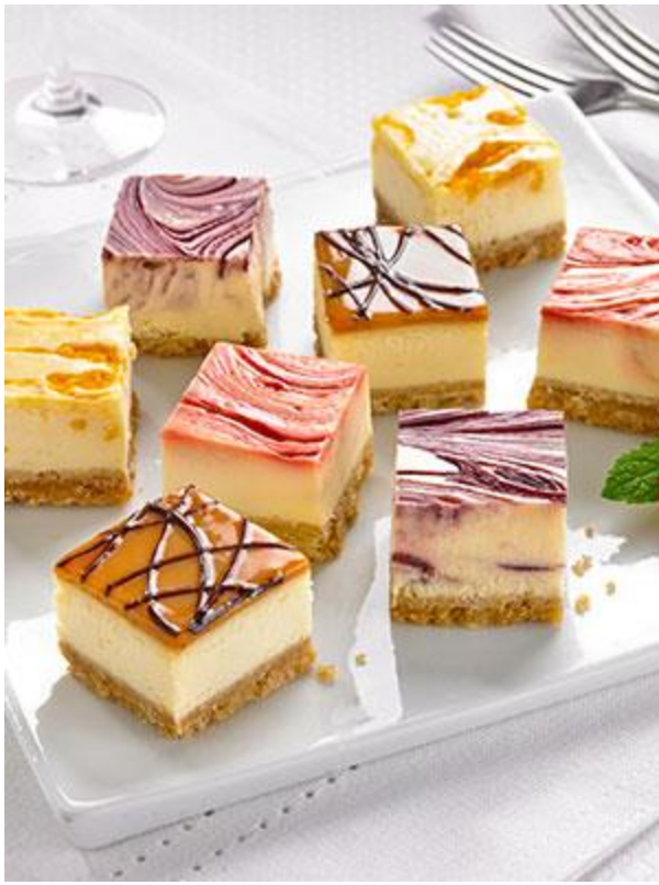
• Mini Cheesecake Selection £15.00