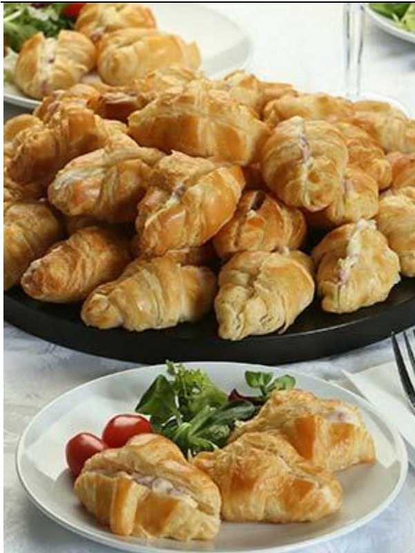
• Mini Filled Croissants £10.00