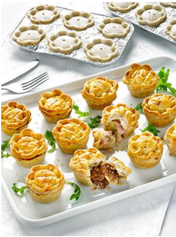
• Mini Pie Selection £10.00