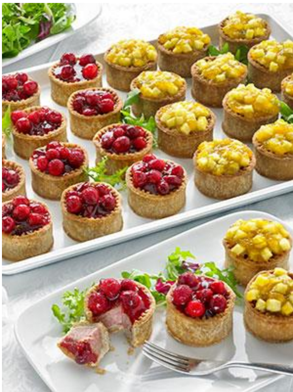
• Cranberry & Apple Topped Dinky Pork Pies £13.00